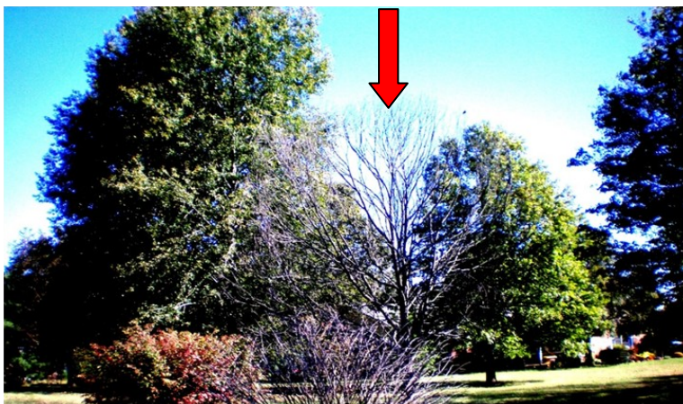
Example 1 shows a mature tree, so dominated by its taller and stronger neighbors, that it has succumbed to drought conditions.

Water flows downhill. When the ground is hard, water flows downhill faster. For trees or any bush, to receive the benefit of water, it must soak into the ground and