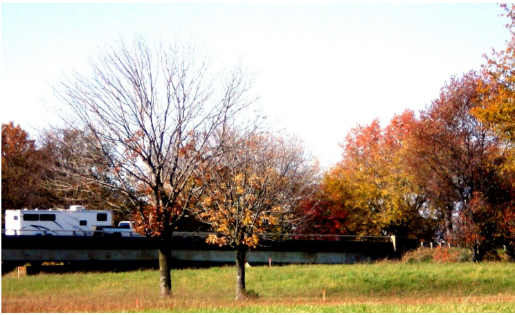
Example 3 is of two dead specimens on hard sloping ground that allowed the available rainfall as easy “runoff” to ditches below.

reach the feeder roots. There is some benefit, of course, from moisture on the leaves and especially the underside of leaves, but by and large, the root system provides the life maintaining supply of water to the plant.