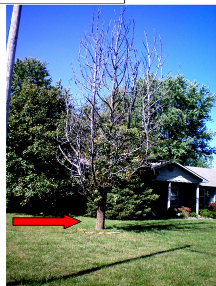
Example 2 shows a tree well on its way to death. Close inspection will note, however, full foliage still near the bottom of the tree.