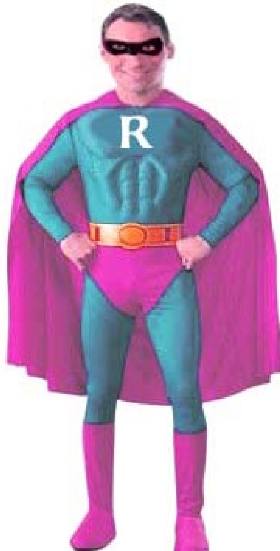
Don't be alarmed if you see a superhero flying above your garden or fighting for the causes of roses.

Roseman replies, "Why, I thought all little children knew to stake their basals against strong winds." But after a quick trip to