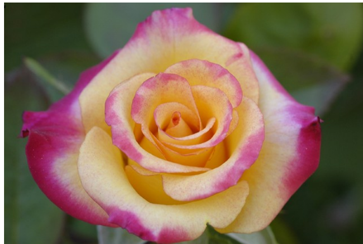
Summer Night, a new Whit Wells miniflora with similar coloration and growth habit to Conundrum. This photo was shot with a 60 mm macro lens for 1/60 second at F/13.

The shutter speed is intuitive, in that the progression follows obviously halved numbers like 1/125, 1/250, 1/500, etc. But the