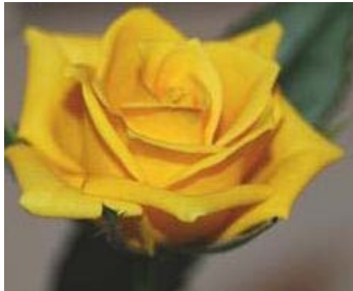
Ty. The fourth Tucker National Queen Reigned Supreme in Indianapolis.