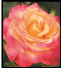
'Dream Come True' - GF