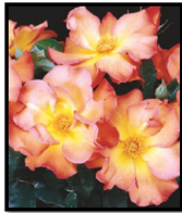
'Playboy' - F