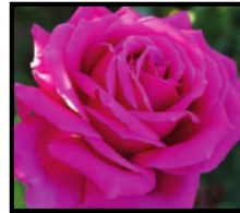
'Lavender Crush' - S