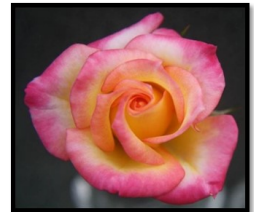
'Sweet Mallie' - M