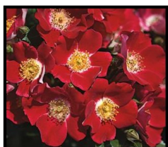
'Miracle on the Hudson' - S