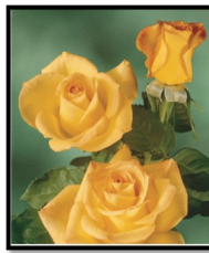
'Gold Medal' - GF