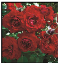
'Oh My' - F