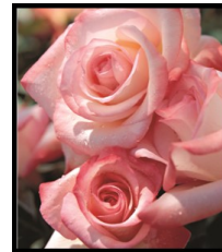
'Gemini' - HT