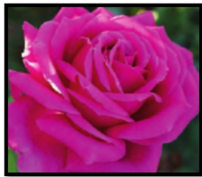
'Miranda Lambert' - HT