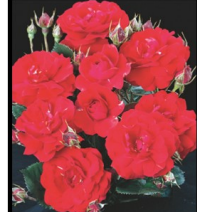
'Tahitian Sunset' - HT