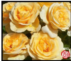
'Sunshine Daydream' - GF