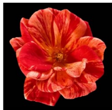
'Tattooed Daughter' - M