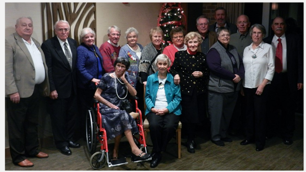
BGRS Members and Guests at Christmas Banquet