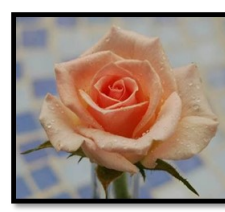
'Covington Ridge' - M