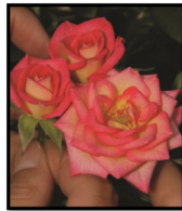
'You're the One' - M