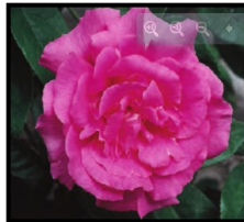
'Zéphrine Drouhin' - B