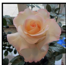
'Crescendo' - HT