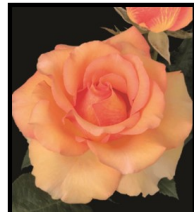
'Showbiz' - F