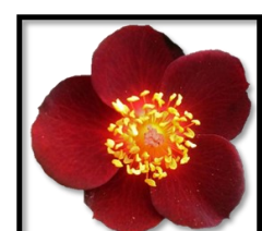
'Maroon Eight' - MF