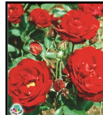
'Europa' - F