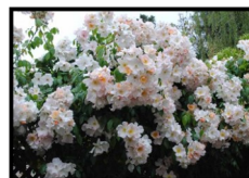
'Sally Holmes' - S