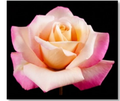
'Miss Mabel' - MF