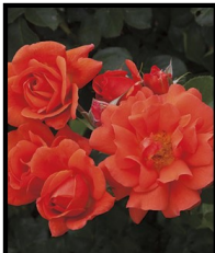
'Above All' - CI