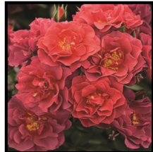
'Cinco de Mayo' - F