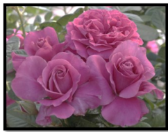
'Pretty Lady Rose' - HT

Photos and complete descriptions are available on our website home page at www.tenarky.org .