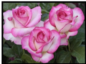
'Miss Congeniality' - GF