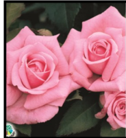
'Belinda's Dream' - S