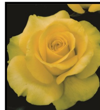
'St. Patrick' - HT