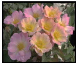
'Watercolors Home Run' - S