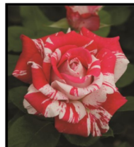
'Neil Diamond' - HT