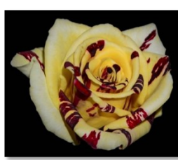
'Alakazam' - MF

Prices will range from $10 –$15 for most of the roses and will be sold to the highest bidder on the silent auction roses!