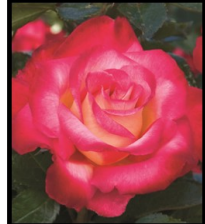
'Dick Clark' - HT