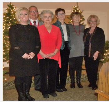
2016 Tri-State RS Board of Directors

Tri-State Rose Society is making plans to participate in the 4th Annual Master Gardeners of Hamilton County Expo in April.