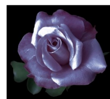
'Brenna Bosch' - M