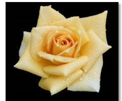
'Moskoot' - M