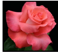
'Touch of Class' - HT