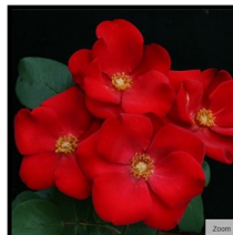
'Altissimo' - LCI