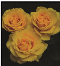
'Doris Day' - F