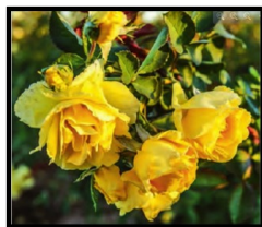
'Good Day Sunshine' - LCI