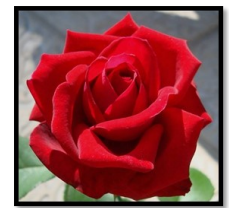
'Bold Ruler' - MF