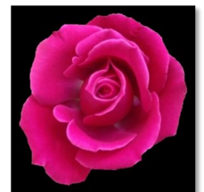
'Petite Princess' - MF