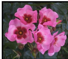
'Raspberry Kiss' - S