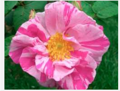
R. gallica versicolor