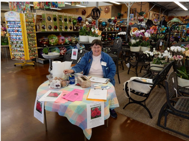
Cookeville Area Rose Society held Rose Education Day in March.