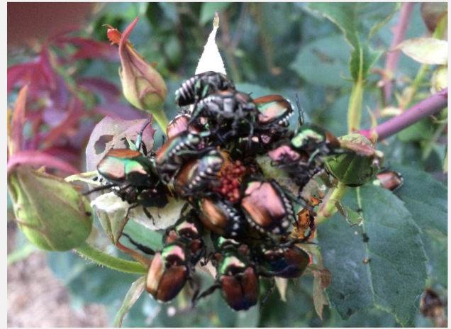
Japanese beetles eating one bloom on 'Strike It Rich' which is their favorite rose to devour in the Hext garden.