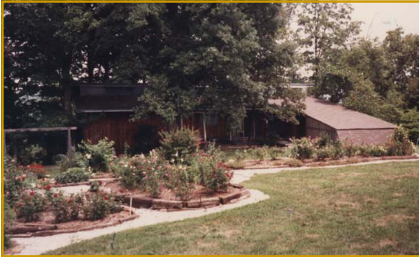
McMahon's Roses

Our society was very well known for its fundraising. It received lots of help from local businesses. My wife would walk into a business (looking just a bit sexy) and say "It won't be necessary for you to give more than $500 this year." She was careful to get dates of special occasions for