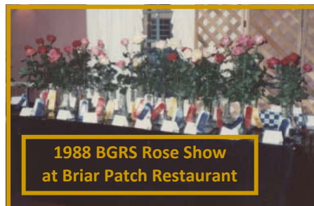
1988 BGRS Rose Show at Briar Patch Restaurant