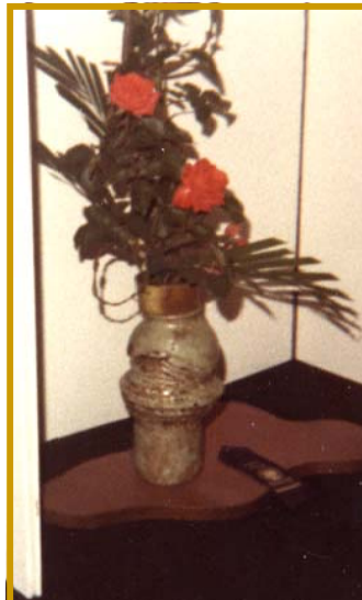
1981 BGRS Rose Show blue ribbon arrangement.